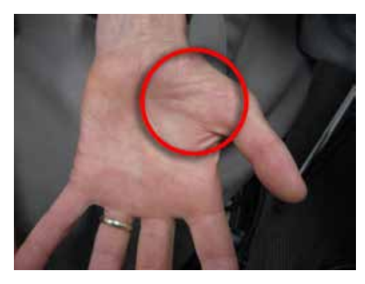
(Note wasting of thumb muscles)